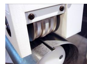
Seam facing inside