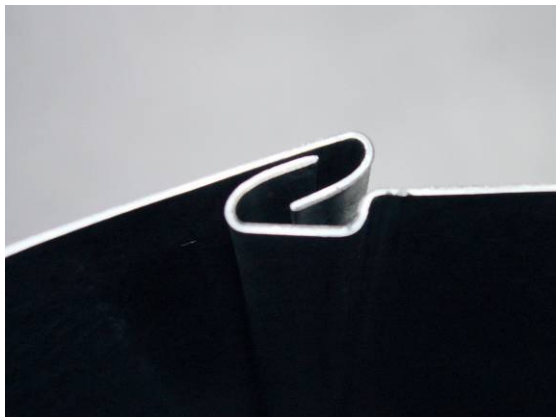
Longitudinal seam plus open hem seam

If you want to make a pipe out of sheet metal and you want to close the rounded material with a seam, there are two options. First, you use the RAS SpeedySeamer and rollform a seam on both ends of the blank. After the first run, you flip the workpiece so that the two seams face in different directions. Then you round the sheet on a rolling machine and hangs the two folds in each other.