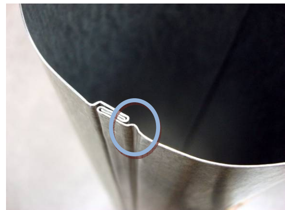
Seamed joint with two longitudinal seam: Uncontrolled material deformation close to the joint

single set of rolls to produce the seams. However, if you hang two longitudinal seams in each other the quantity of material is too much and the seam closing machine deforms the extra material uncontrolled. Moreover, it is hard to predict if the seam closing machine will close the seam outside flush or inside flush.