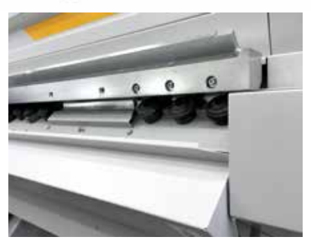
Easily accessible forming rolls for maintenance work.

The DuctZipper in L-shape is specifically designed for large ducts. On the DuctZipper-L the working position is rotated by 45 degrees. The horizontal flange of the duct rests on the table while the vertical flange is directed straight up. Gripping grooves in the vertical wall let the operator easily hold and guide the duct while passing it through the machine.