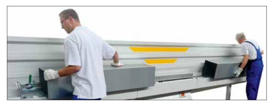
Operating speed doubled: After the first duct is finished and removed, the operator clamps the next duct with the AutoPilot and is ready to pass the next air duct through the machine.