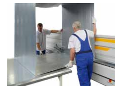
Even very large ducts can be produced with only two operators.