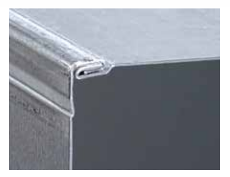
Improved seaming accuracy also results in a reduced distortion of the duct cross-section.